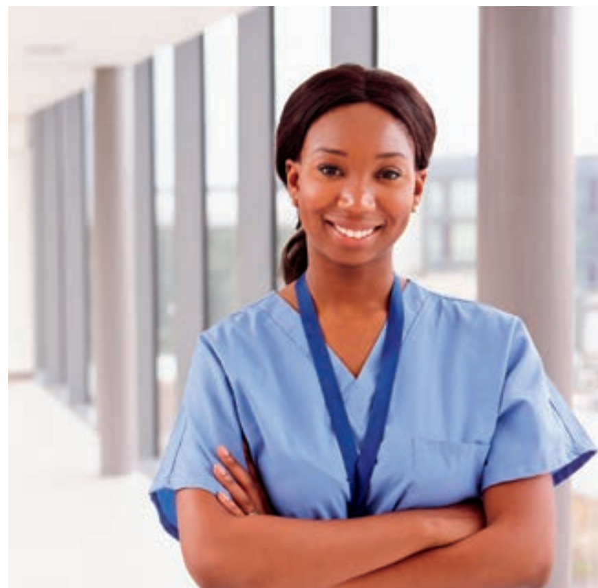
Y&H Training Courses